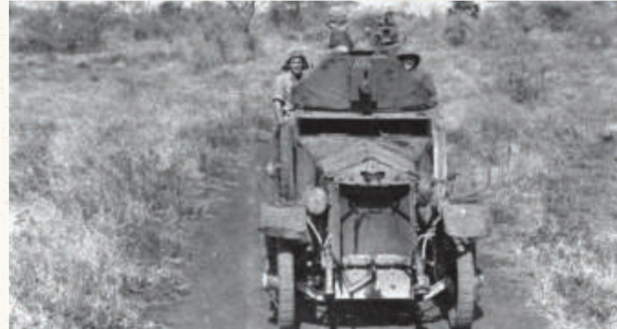
Going to war in a Rolls Royce!