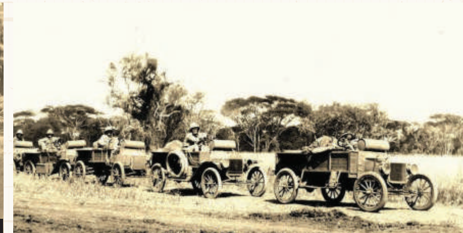
In late 1915 motorised transport arrived in East Africa. These Model T Fords never superseded the use of porters who did not need made up roads and tracks.