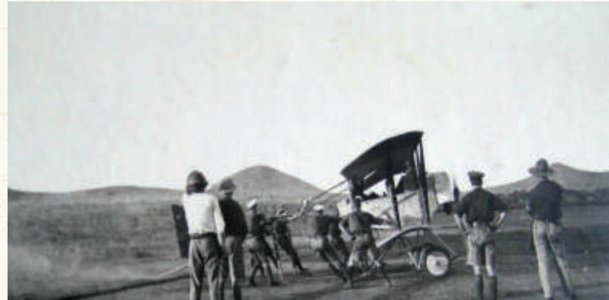
A Royal Navy Air Service No 4 Expeditionary Sqd Caudron GIII with its 89hp Gnome engine gaining revs prior to take off from Maktau as ground crew hang on until the pilot signals them to release the craft. Max speed was about 60mph.

Legend has it that a German woman was camped in this magnificent hollow Baobab Tree, targeting British troops as they tried to attack Salaita Hill.