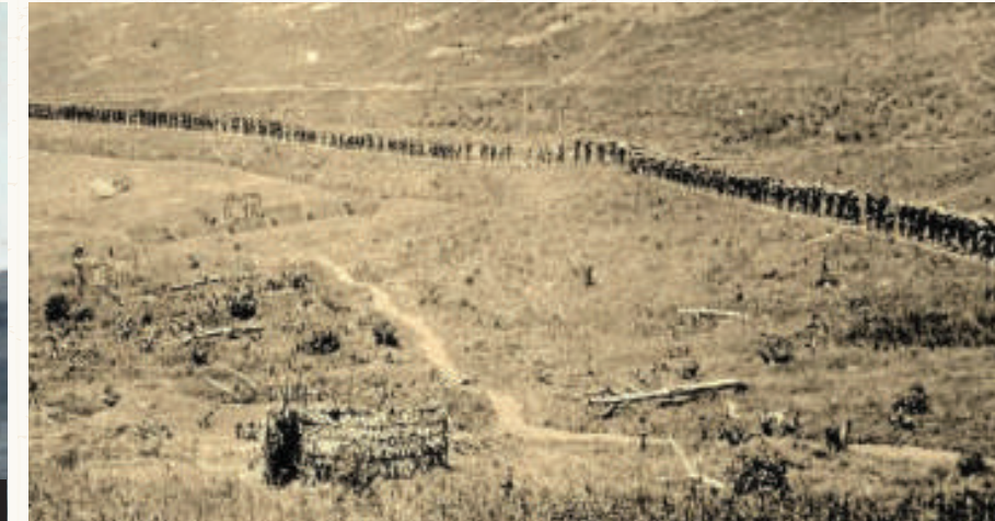
Carrier Corps Porters were used through out the East African Campaign