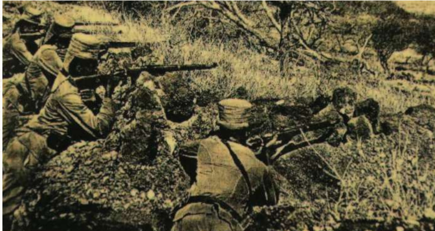
German Schutztruppe dug in on Salaita Hill October 1914.