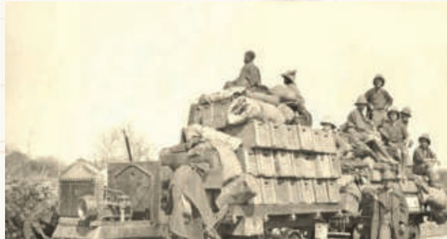
The Voi-Maktau Military Railway line.