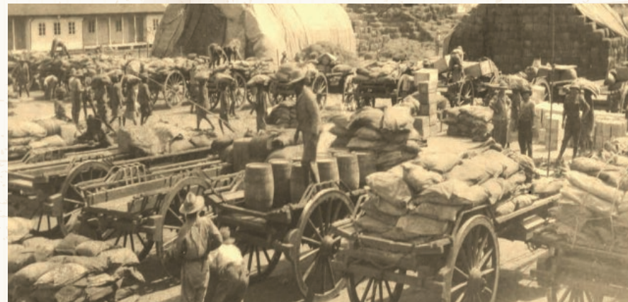
Voi Railway Station Nov 1914. Note the large number of straw bales of fodder that was needed to feed the oxen, horses, mules and other livestock on the front at Maktau.