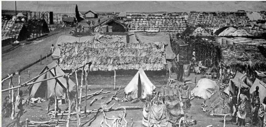
Maktau Camp, home, between 1914 & 1916 to thousands of British Empire Forces as they prepared to head for the front towards Mt Kilimanjaro off in the distance.